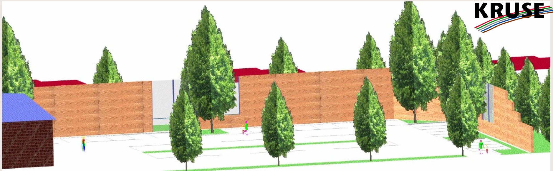
Isometrie aus Norden (Wandhöhe: 6,0 m)